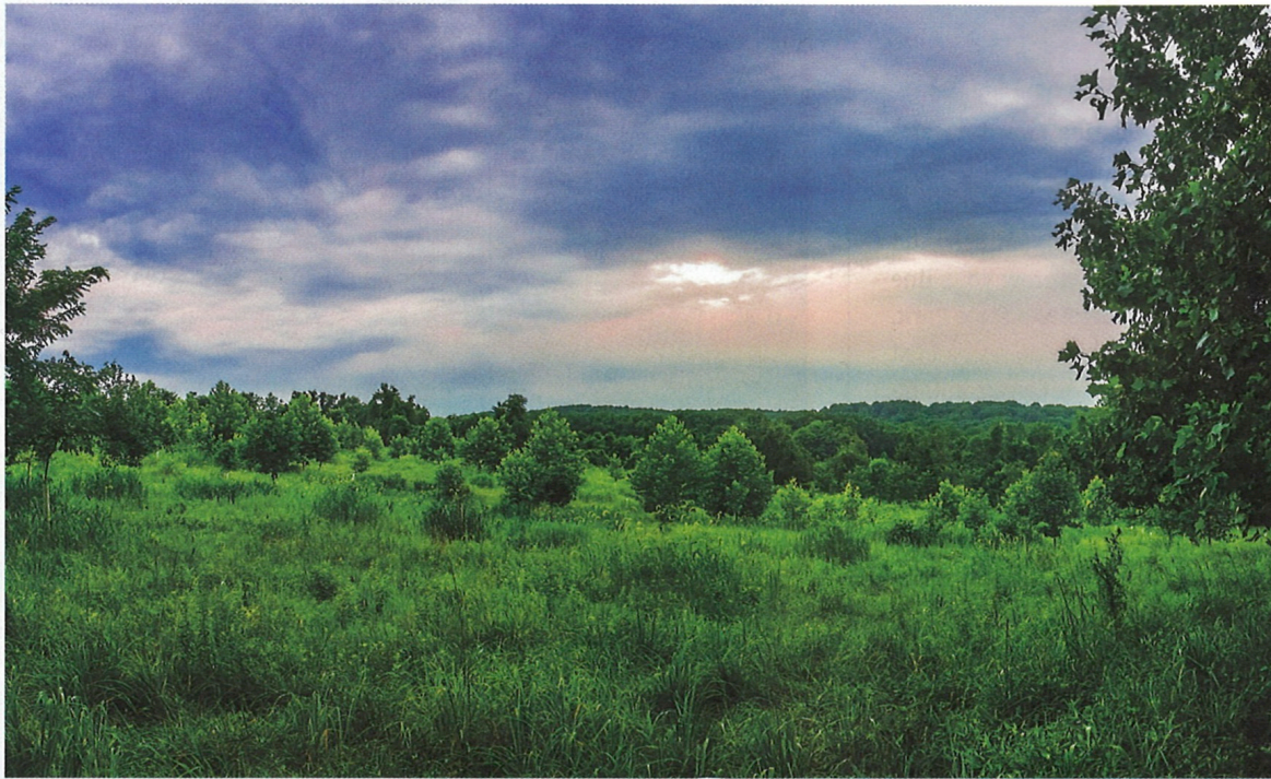
CLOCKWISE FROM LEFT: Susquehanna State Park; Cook Forest State Park; Kingsmill Golf Club. Opposite page: New River Gorge; a BASE jumper on Bridge Day.