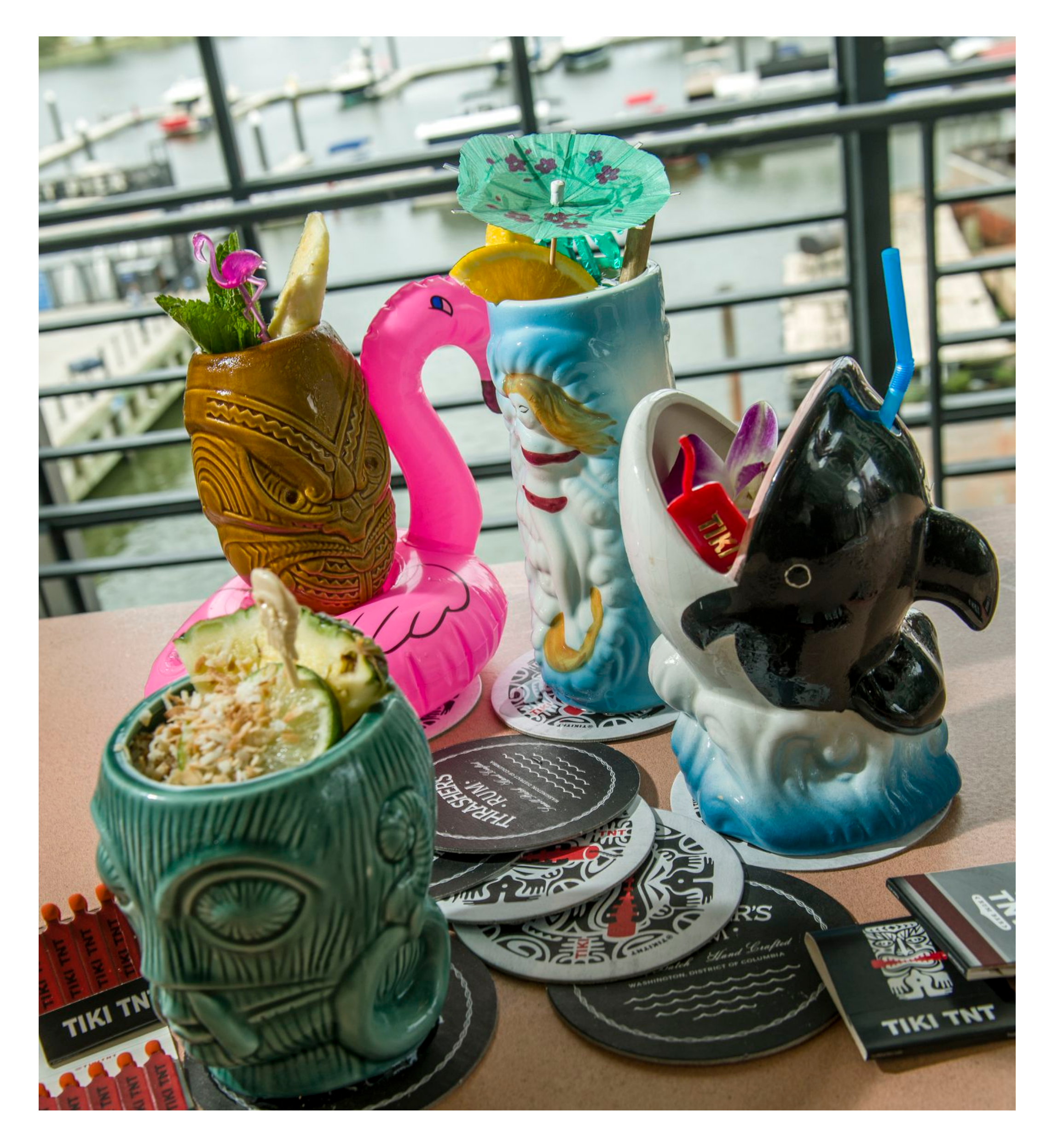
Thrasher's green spiced rum goes into an off-menu rum and tonic.